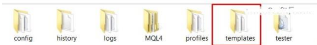
Pic.4 Templates Folder

– NOTE: Template files must be NOT in “MQL4 folder” . Copy your .tpl files into templates folder (Picture #4). You can find templates folder when open your Data Folder)