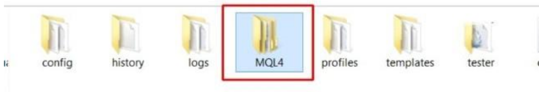
Pic.2 MQL4 Folder

Here you will find a folder called MQL4 :